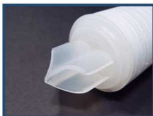
Spear / Fin