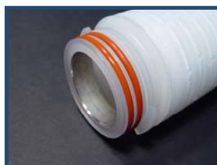
2-226 O-Ring With Stainless Steel Ring

Note: The stainless steel rings are only available in the 2-222 and 2-226 end caps. Please reference the ordering guide on your data sheet and replace the N with an S .