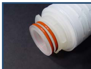
2-222 O-Ring / 3 Tab