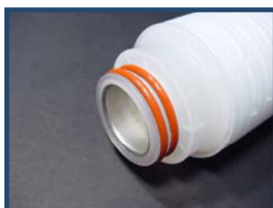
2-222 O-Ring With Stainless Steel Ring