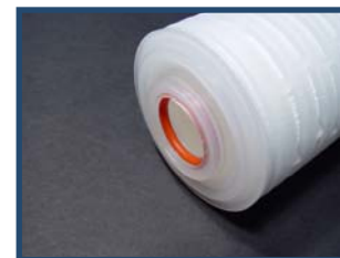
Internal O-Ring 213 / 119