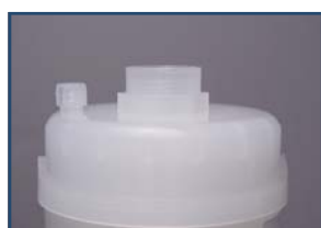
1/2" Female NPT