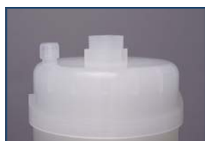
1/4" Female NPT