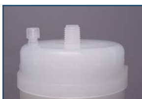
1/4" Male NPT