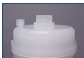
3/8" Female NPT