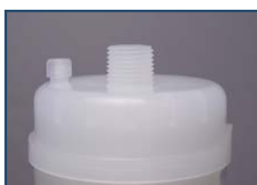
1/2" Male NPT