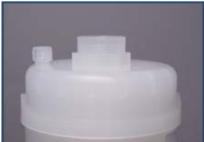
1/2" Female NPT