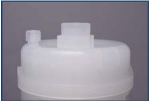
3/8" Female NPT