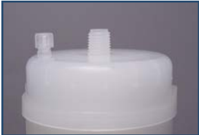
1/4" Male NPT