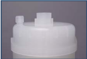
1/4" Female NPT