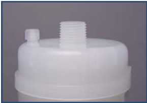
1/2" Male NPT